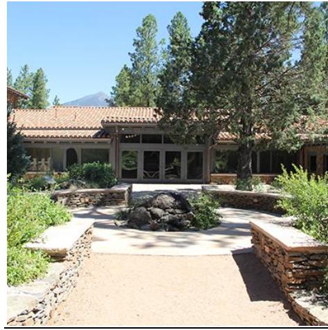
Museum of Northern Arizona